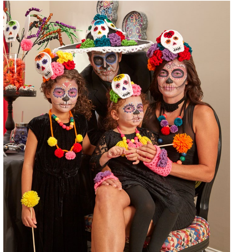
Patterns shown: Day of the Dead Necklaces, LW5403 Flower Wristers, LW5399 Sugar Skull Child Headpiece, LW5398 Sugar Skull Toddler Headpiece, LW5400 Sugar Skull Woman's Hat, LW5401